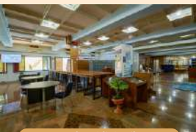
O. Notohamidjojo Library