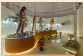
Sangiran Archeological Museum