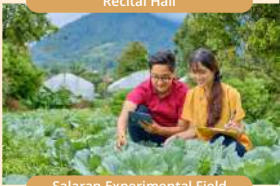
Salaran Experimental Field