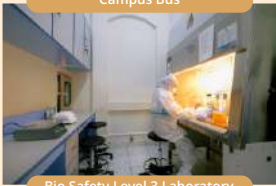
Bio Safety Level 3 Laboratory