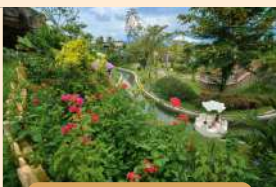
Saloka Theme Park