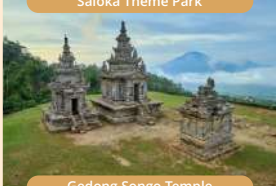
Gedong Songo Temple